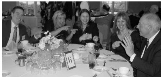
▲ "Just as I thought. You haven't washed those hands since your last pleading, right?"