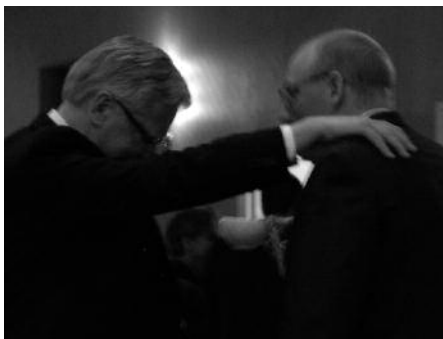
▲ "Baruch Ata Adonai ..."