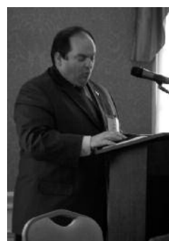
▲ "And if elected ..."