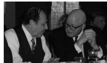
▲ "You know, now that I'm not a judge anymore I think maybe I'll try my hand at lawyering."