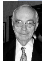
▲ The Hon. Joseph A. Hudock