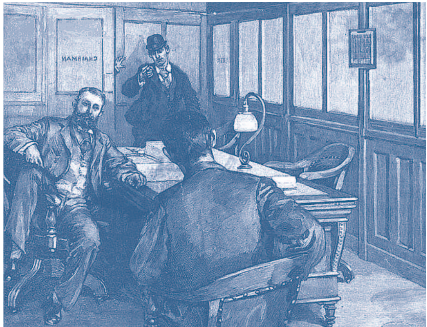
▲ Alexander Berkman's attempt to assassinate Henry Clay Frick, as illustrated by W. P. Snyder in 1892, originally published in Harper's Weekly.