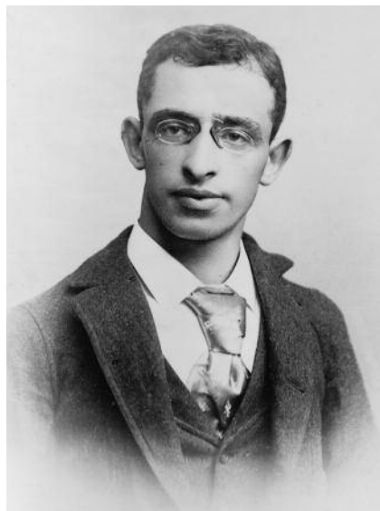
▲ Alexander Berkman

Now he had come to Pittsburgh by a long train ride, during which he had tried to enjoy the sight of the passing