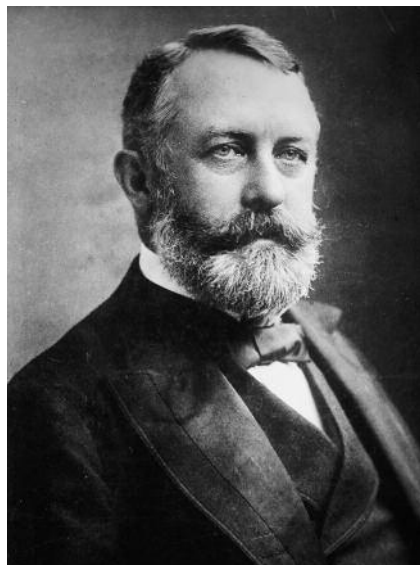
▲ Henry Clay Frick

At the Allegheny County Jail, Berkman later related, in an effort to procure the names of his co-conspirators (there were none, though several local anarchists were arrested and released), he was fed salty food and deprived of water for three days before the interrogation was abandoned. He then started to receive letters from a "striker" who wanted to blow up the mills, requesting the