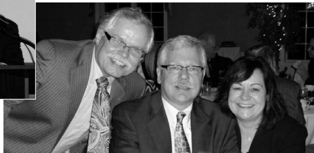
▲ Despite obvious clues, Peggy still clings to the fantasy that the three of them had been separated at birth.