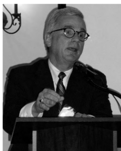
◀ "I know I'm not your typical Republican, but come on, I look nothing like the President."