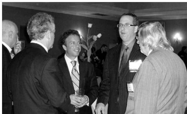
▲ "Whenever I make this face at the jury, they forget all about the evidence. Works like a charm."