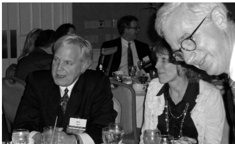
▲ Anxious to be remembered, the immediate past president pathetically ran from table to table, inserting his head into every shot just before the shutter clicked.