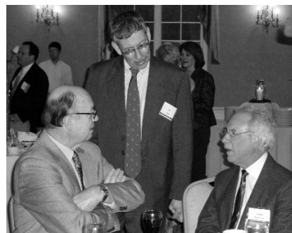
▲ "Don't cross your arms at me. I said you're a Fascist and I meant it."