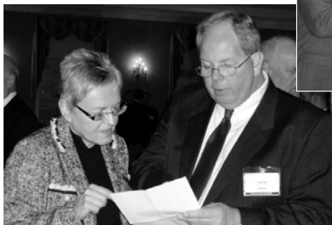
▲ "Yes, George, it does say you inherited $7 million from a distant great aunt in Nigeria, but I'm just sayin' don't close your practice yet."