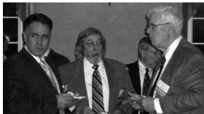
▲ "You know, Judge, your rulings on evidence have been pretty lame lately. Want some tutoring?"