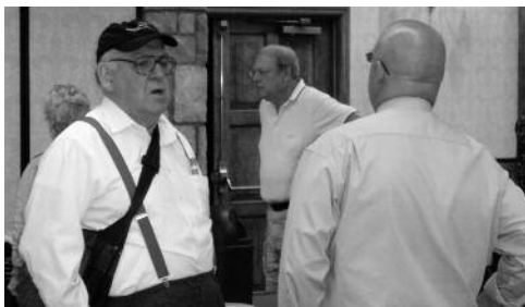
▲ "You look like you have problems. Wanna tell me about it?"