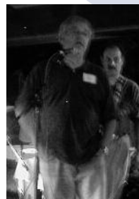
▲ "I appreciate it, I truly do, but believe me, bowing is not at all necessary."