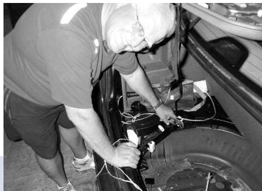
▲ "Where's the damn crank? When I was a kid, there was always a crank!"