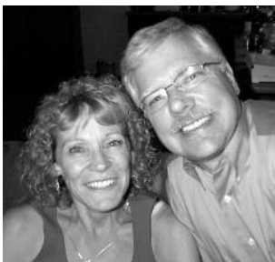
▲ "You're the only woman in the world for me, and by the way, I'm running for judge."