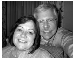
▲ "You're the only woman in the world for me, and by the way, I'm running for judge."