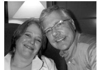
▲ "You're the only woman in the world for me, and by the way, I'm running for judge."