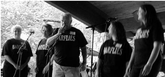
▲ "Does anyone remember my lines? Anyone? Please?"