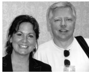
▲ "You're the only woman in the world for me, and by the way, I'm running for judge."