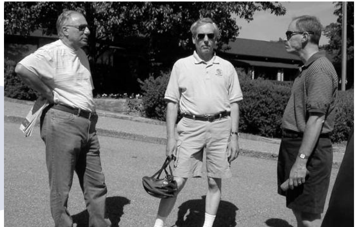
▲ "I say we add motors to our bicycles, call ourselves The Tired Old White Guys and terrorize ourselves a mall or two."