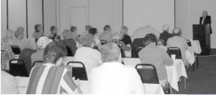
▲ The Pennsylvania Attorney General's Office and the WBA were in New Kensington on May 31 to present a seminar on "How to Avoid Living Trust Scams: The Truth About Living Trusts."