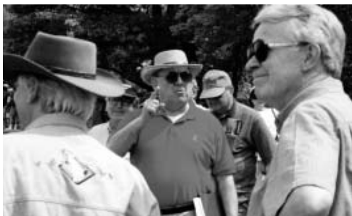
▲ "Out of order! You are out of order!"