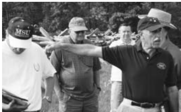
▲ "Now the soldiers suffered from this same problem, but they didn't have Q-tips."